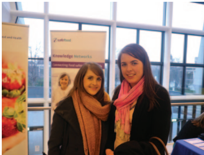
Student delegates attending the Food Research Conference