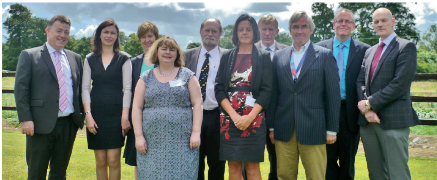
Speakers at the Food Fraud event held in Dublin

Find the seminar presentations and a number of video interviews with speakers on http://safe food.ning.com and safe food.eu .