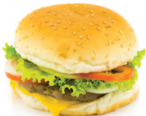
VTEC WAS FIRST IDENTIFIED IN CATTLE AND UNDERCOOKED BURGERS

In recent years, PCR has become much more routine and affordable. It has many potential advantages and would benefit food testing laboratories.