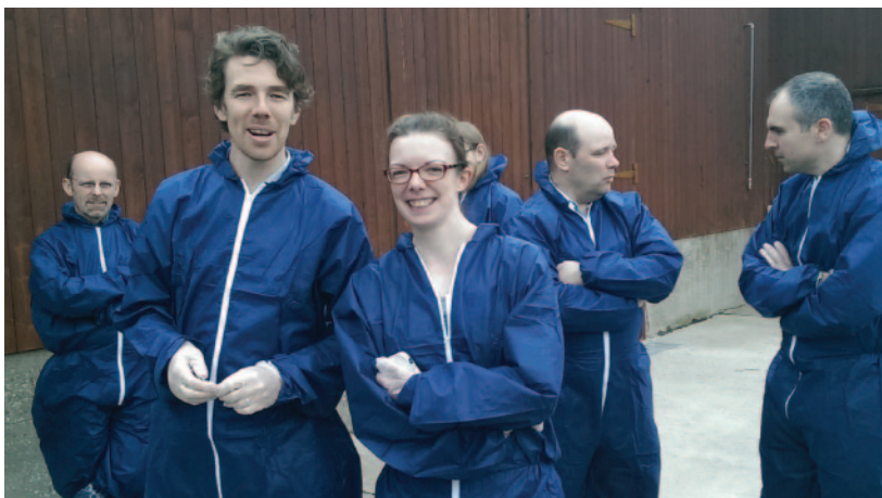
CONFERENCE ATTENDEES ENJOYING THE VISIT TO A BROILER FARM