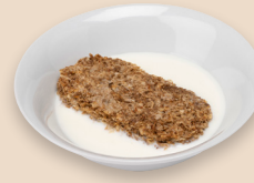
1-1 1/2 wheat biscuits