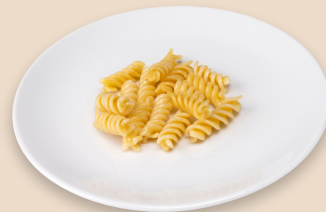
1/2 cup (30-40g) cooked pasta