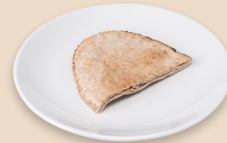
1/2 pitta pocket