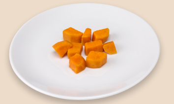
1/2 cup (30-40g) cooked sweet potato or yam