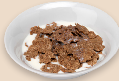
1/2 cup (30g) flaked cereal fortified with iron

Each of these examples shows one serving