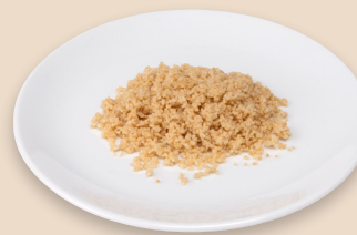
1/2 cup (30-40g) cooked rice