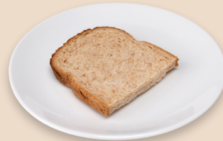
1/2-1 slice bread