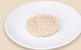
1 plain rice cake