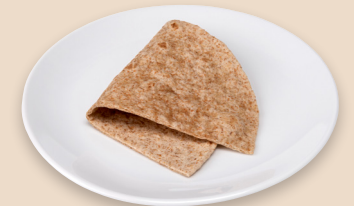
1/2 small wrap