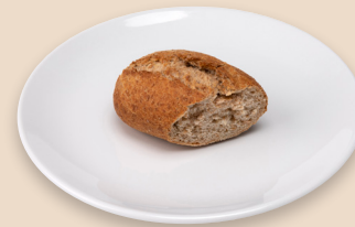
1/2-1 small roll