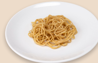
1/2 cup (30-40g) cooked noodles