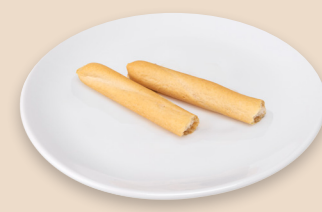
1 unsalted breadstick